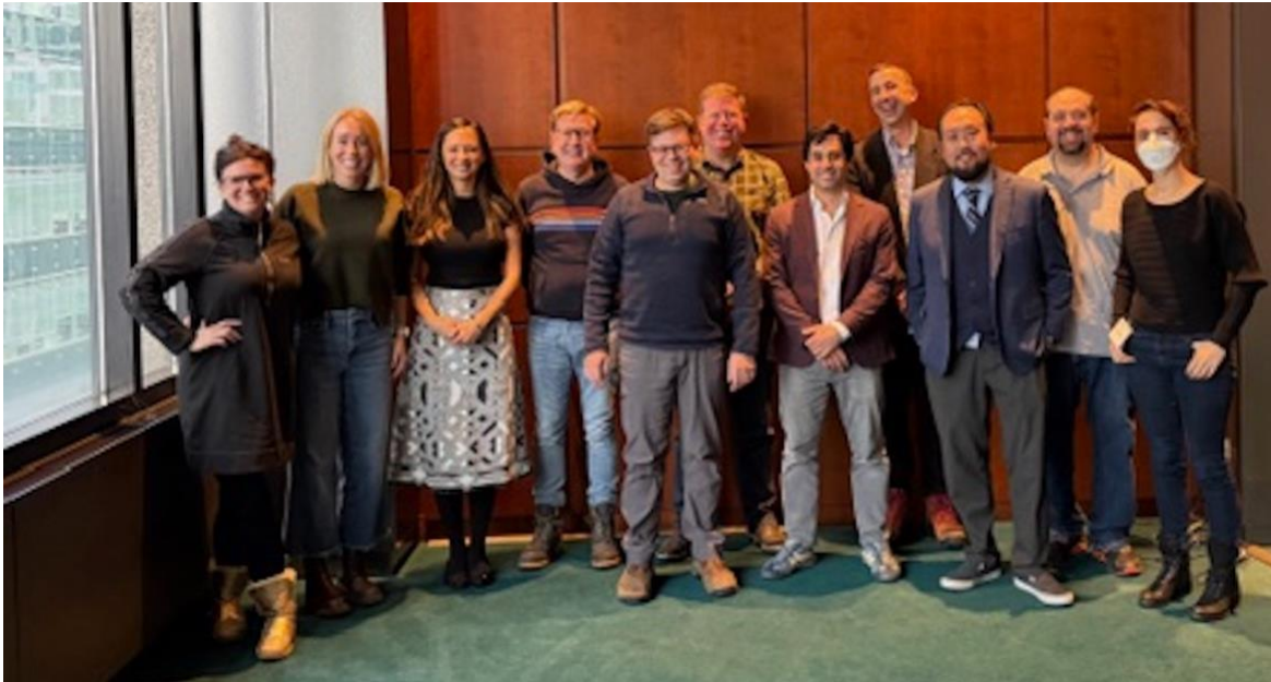
IP scholars at the 2025 Chicagoland IP Workshop