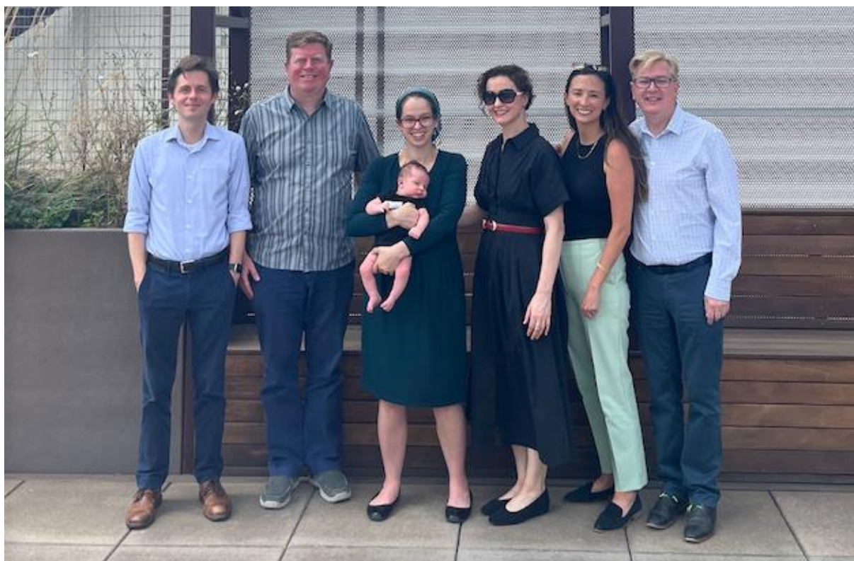
Several Chicago-Kent IP faculty members at 2025 IP Scholars Conference (DePaul)

Chicago-Kent at the Forefront of Studying the Legal Implications of AI in Scholarship and in the Classroom