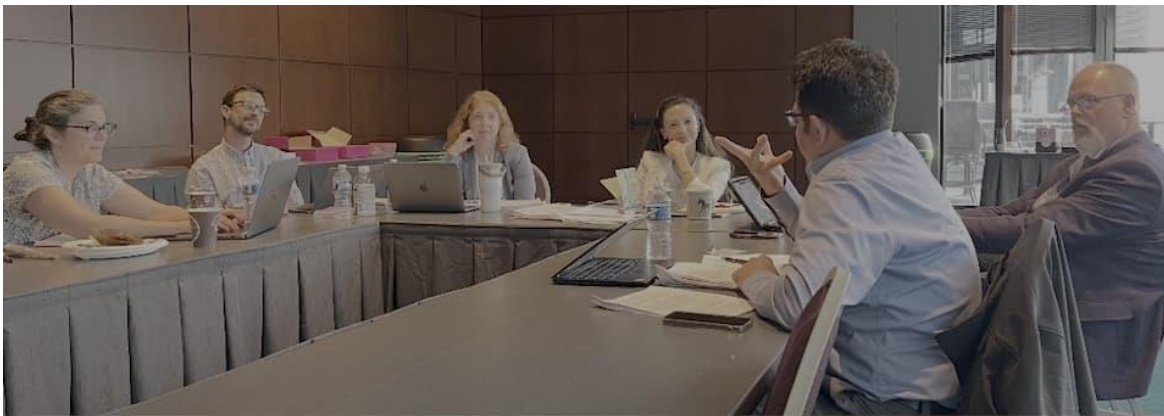
IP scholars in discussion at M 3 Workshop at Chicago-Kent